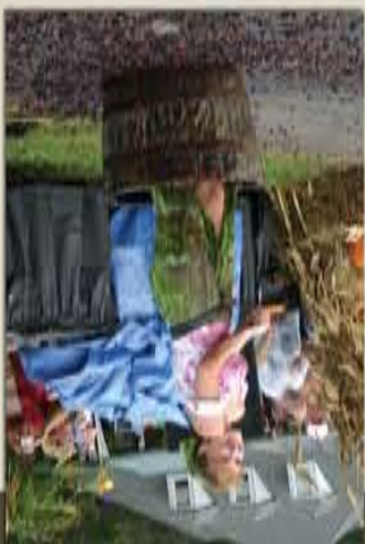
September "Grape Stomp" at Morgan Creek Vineyards

Some vineyards offer a selection of products including vinegar, tea, jelly and others in their retail stores and on their websites. Wine has evolved from a social drink to a drink that you can toast to your health. Moderate wine consumption has been shown to have positive health benefits due to its high level of antioxidants, especially for us here in the state of Alabama. Grape wines, specifically Muscadine wines, attribute their high antioxidant level to their content of resveratrol, flavonoids and ellagic acid. Resveratrol, found in grape skins and seeds, increases good cholesterol (HDL) and helps prevent blood clots. Flavonoids also help to prevent clots and plaque from forming in the arteries, lowering one's risk of heart disease by lowering bad cholesterol (LDL) in the body. Moderate consumption constitutes one drink a day for women and two drinks a day for men.